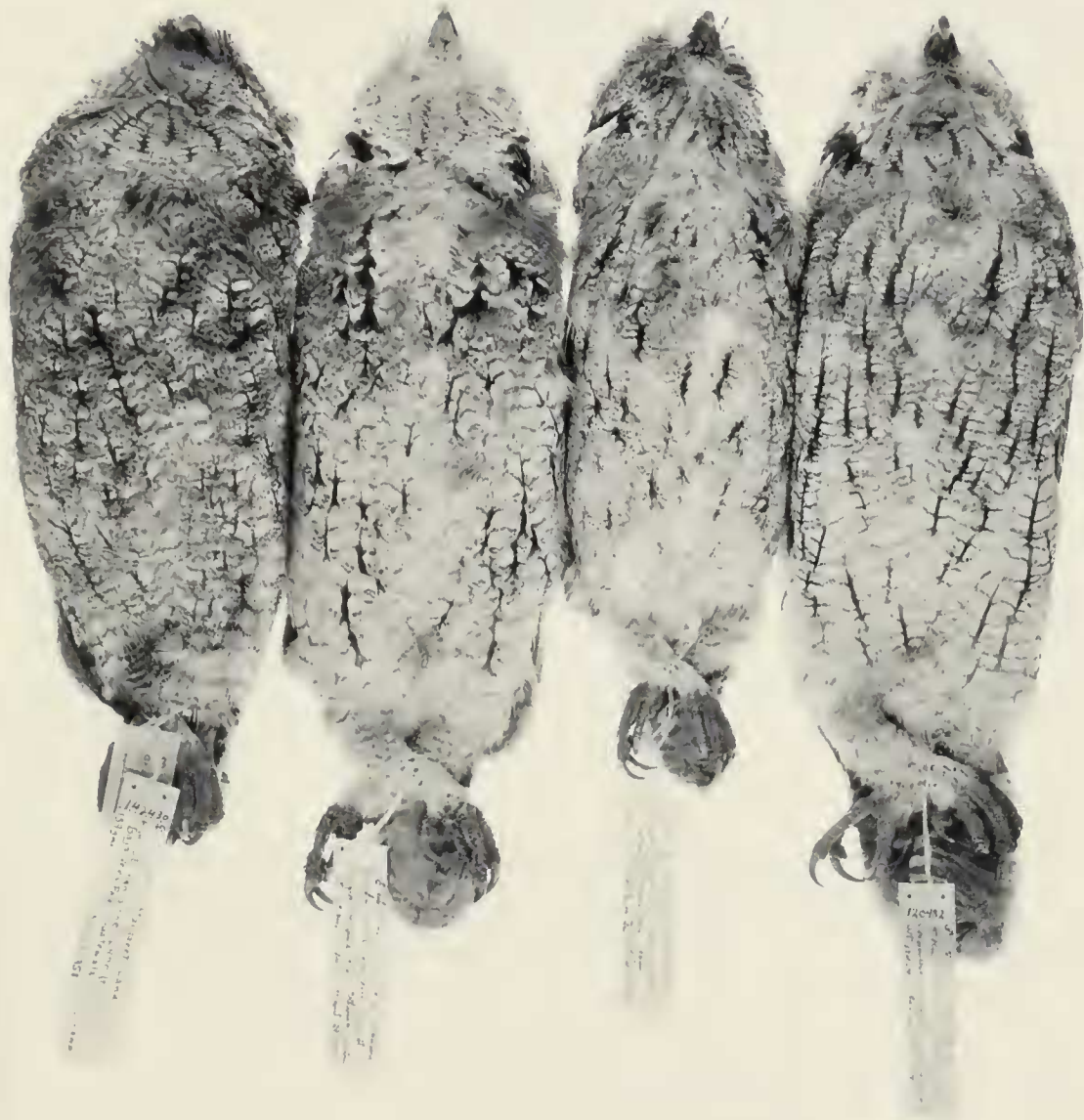
163707, Dept. Tumbes, Perú); and O. choliba crucigerus (MVZ 120482, Dept. Huila, Colombia).

Characters. —Resembles O. r. roboratus of the mid-Marañon drainage east of the western Andes but much smaller in length of wing, length of tail, length of bill and body mass and averaging slightly grayer, especially dorsally.